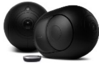
Devialet Phantom 1 Mono / Stereo