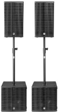
HK Audio L3 Half Stack