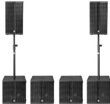
HK Audio L3 Full Stack