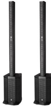
HK Audio Polar Stereo