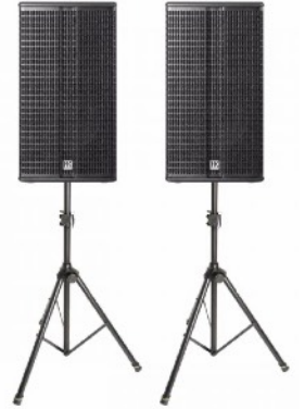
HK Audio L3