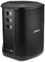
Bose S1 Pro