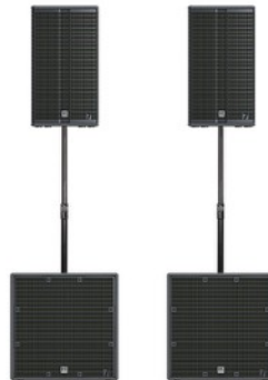
HK Audio L7 Half Stack